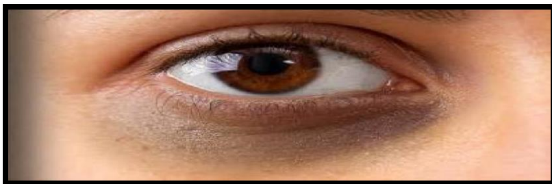
Figure#2: Appearance of Dark Circles under Eye

Any assessment of lower eyelid DC should start including suitable comprehension of the fundamental periorbital life structures. The laryngeal canal is an anatomical depression that is encountered in people of all age groups. Dark circles under eyes are of many types and classification mainly depends upon the cause of dark circles.