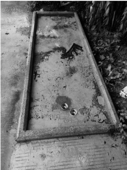
Figure 2: Renderings of the garbage collection point renovation

Two stainless steel sealable and openable floor drains are set on the hardened ground of the garbage collection point, one for collecting rainwater and the other for collecting rainwater. On sunny days, the floor drain for collecting sewage is opened, and the floor drain for collecting rainwater is closed. At this