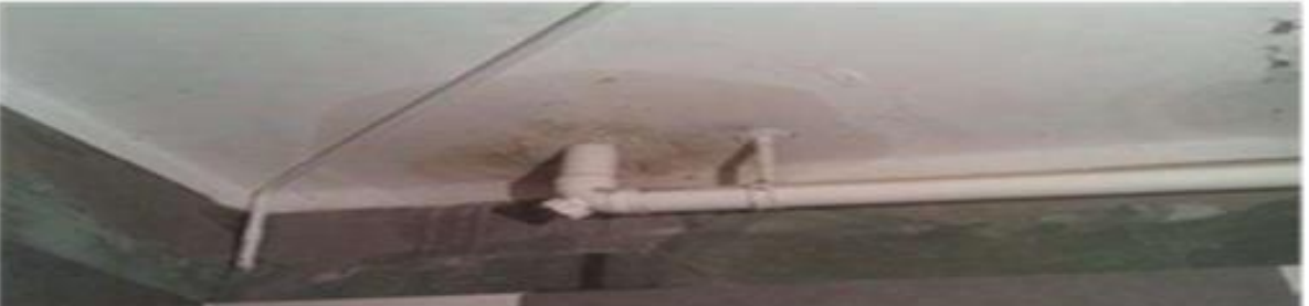
Figure 3: Kitchenand toilet leakage