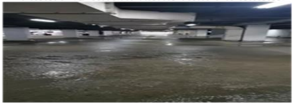
Figure 4<sup>.</sup> Rasementand underground garategakage

Interdisciplinary Journal of Engineering and Environmental Sciences| https://sadijournals.org/index.php/ijees